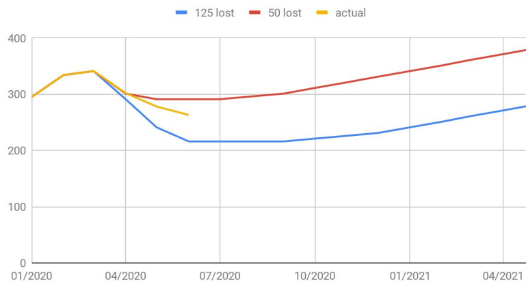
Projected member count based on Covid19

Current members: 263 , includes: 146 Regular; 17 six-month; 10 twelve-month; 23 Student; 45 Seniors; 6 Starving Hackers; 15 family/spouse; 1 Patron. Not counting: 15 pending; 3 unpaid keyfob. (as of 6/17/20). There was a net decrease of 15 members since the last report.