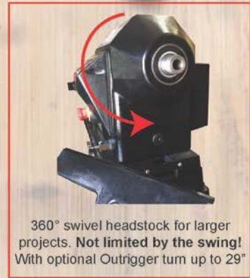
360° swivel headstock for larger projects. Not limited by the swing! With optional Outrigger turn up to 29"